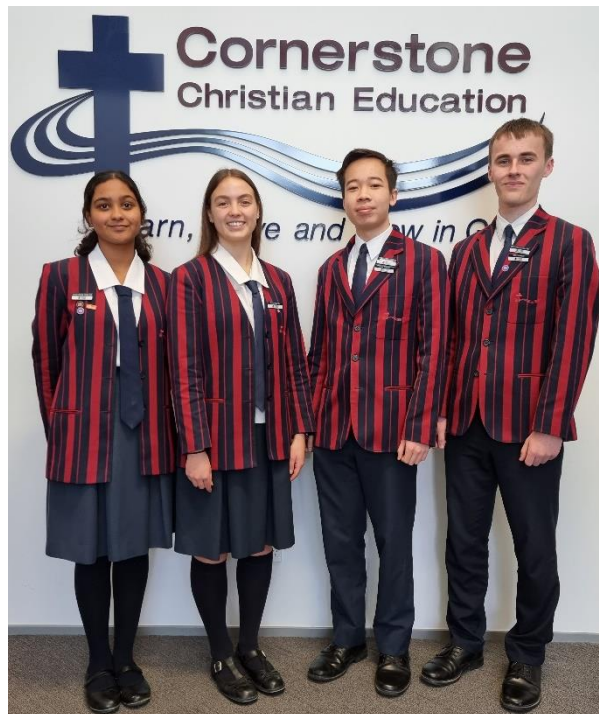
Above left: Examples of Years 7-10 uniform