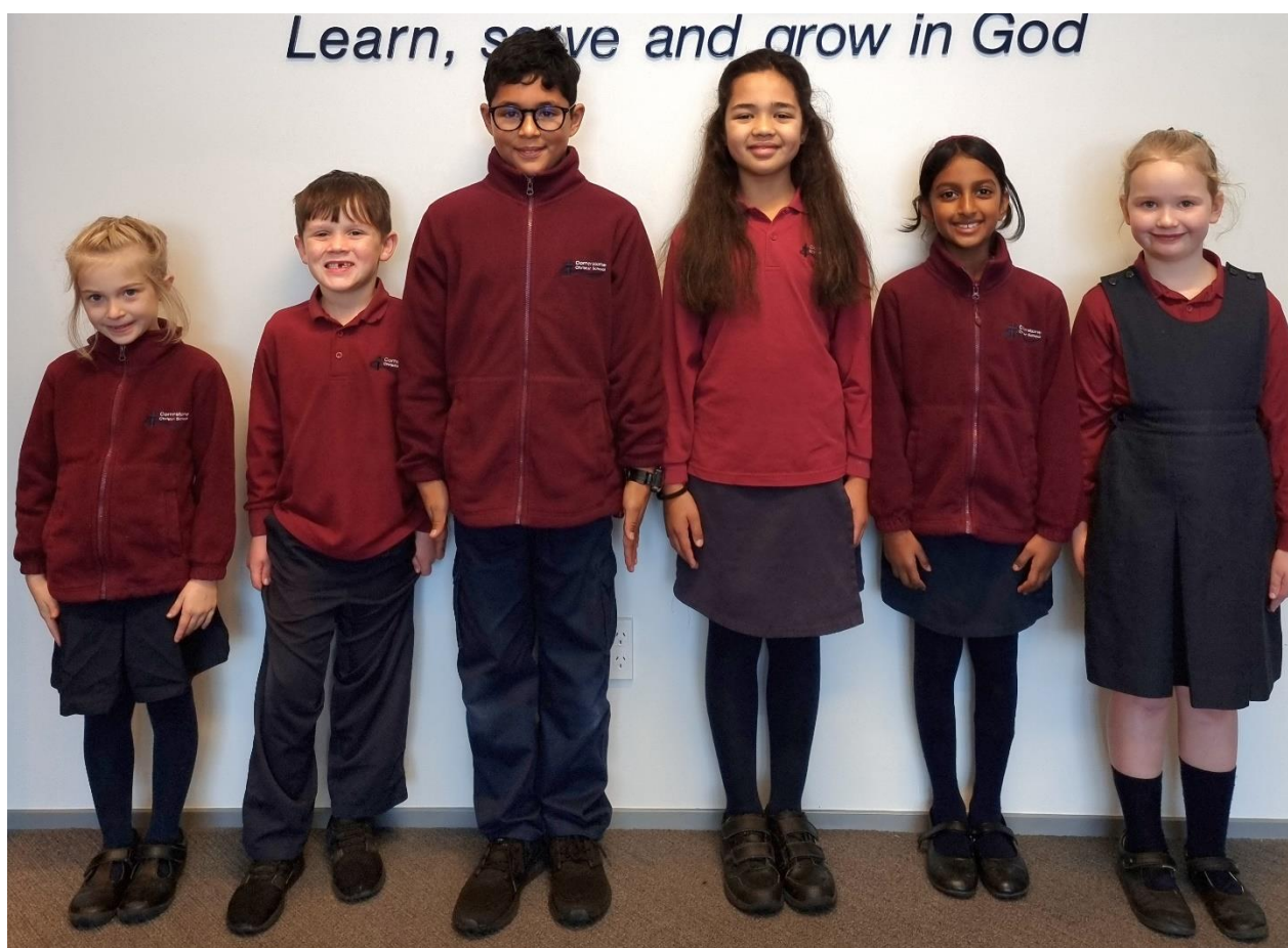
Above: Examples of Year 1-6 uniform (note: pinafore is being discontinued)