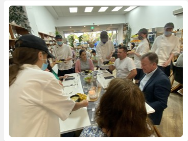
Y9 & Y10