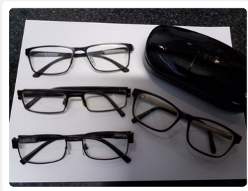
Prescription glasses, 1 pr with an Alex Perry case