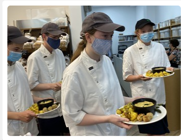
Y9 & Y10

The highlight of the junior course was a Y10 Student Dinner. It was a great opportunity to showcase what we've been learning and team up to host our Cornerstone families and teachers.