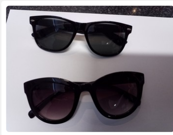
Child size sunglasses