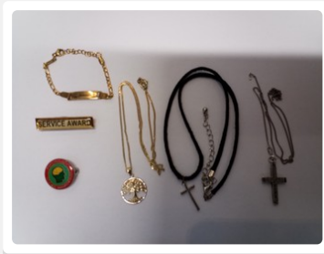
A service award, Science award, bracelet & 3 necklaces

We also have the following items in the office, they have been here for a while. If you recognize your keys, prescription glasses, sunglasses, watch, or jewellery items. Please call into the office to collect them.