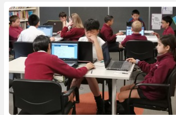
Students in ICAS Science Assessment