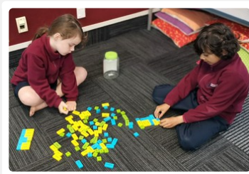
D3 Student Activities