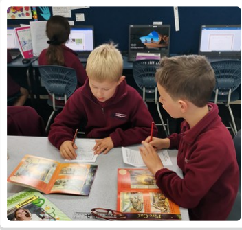
D3 Students Working Hard