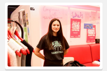
Re.drobe - On Trend Secondhand Clothing