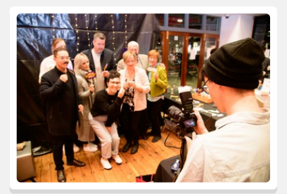
Snap - Affordable Mobile Photobooth