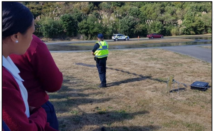
Police Studies students watch on as a fleeing motorist is road spiked then arrested in a scenario at the Police College Open Day in Porirua last Thursday.