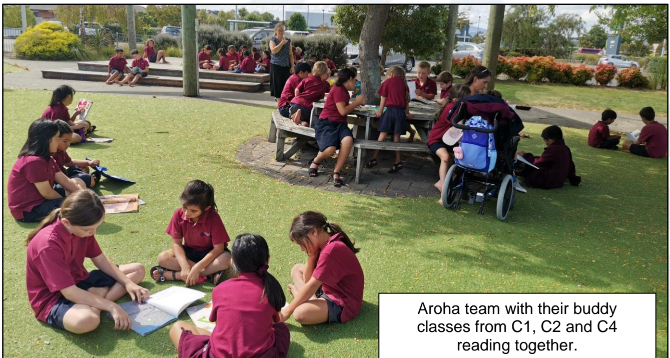
Aroha team with their buddy classes from C1, C2 and C4 reading together.

Manawatu GymSports is offering holiday classes. These are a great way to try gymnastics out if you are keen on registering for Term 2. Also fantastic if you just wish to burn off some energy and have some fun during the holidays. Holiday and Term timetables are available on their website www.manawatugymsports.co.nz . Enrolments for new members for Term 2 open on 9th April.