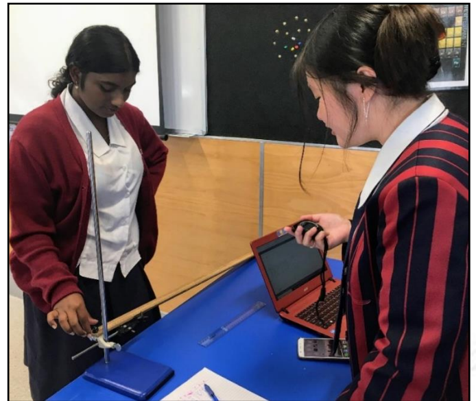
Level 3 Physics students doing a practical investigation.