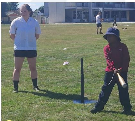
Aroha team have been practicing their tee ball skills this week. Rohi from D1 hits the ball into the air!

Orders will not be placed until the funds have cleared.