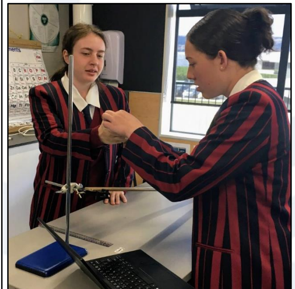
Level 3 Physics students doing a practical investigation.