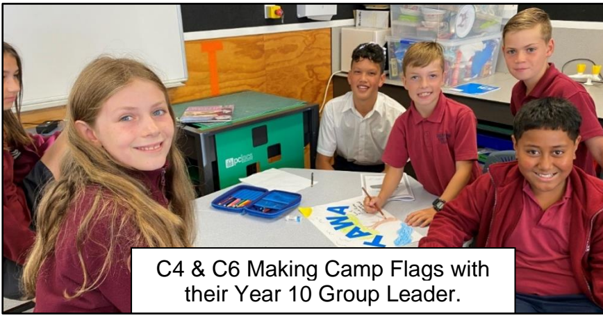
C4 & C6 Making Camp Flags with their Year 10 Group Leader.