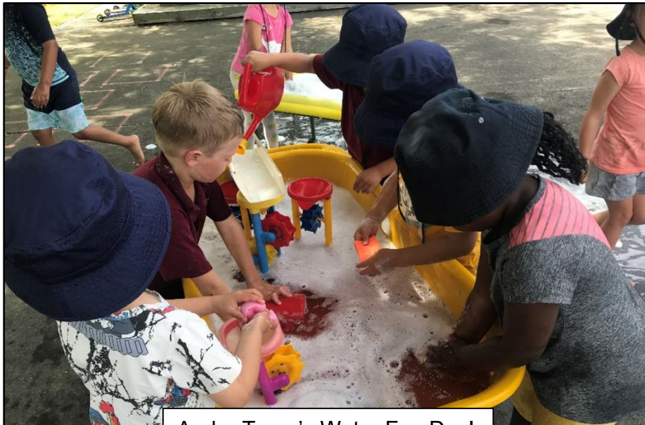
Aroha Team's Water Fun Day!