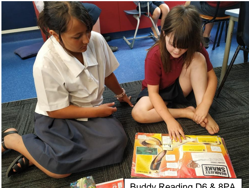
Buddy Reading D6 & 8PA