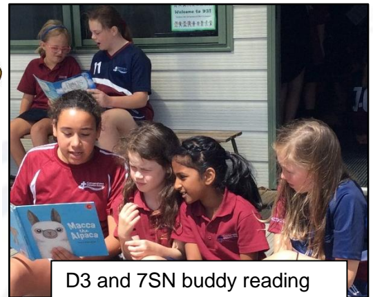
D3 and 7SN buddy reading