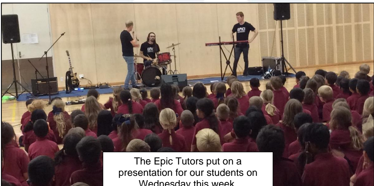
The Epic Tutors put on a presentation for our students on Wednesday this week.

Contact: office@cornerstone.ac.nz | 06 356 7326 | cornerstone.ac.nz