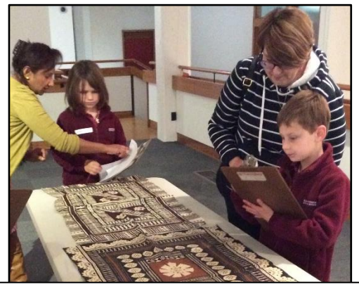
D3 Visited Te Manawa Museum last week.

REMEMBER our KickStart Breakfast club is open Tuesday and Thursday in G1 from <sup>8.00am</sup> and everyone is welcome to come in for a bowl of Weet-Bix & milk!