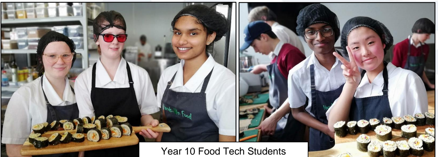
Year 10 Food Tech Students Making Sushi

We have had a few cases of Head lice in the school recently. Please can you check your child's hair for these pests and in the event that your child has Head lice please treat them before coming to school. Thank you! Treatment is free on a prescription from your GP.