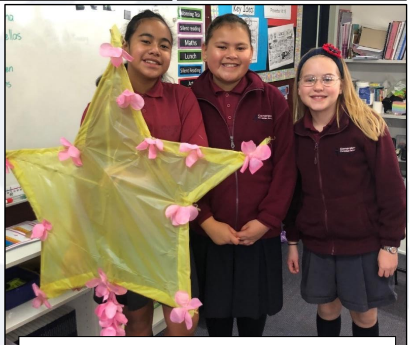
Our C4 students have been busy making kites. Here are some of their awesome designs!

Contact: office@cornerstone.ac.nz | 06 356 7326 | cornerstone.ac.nz