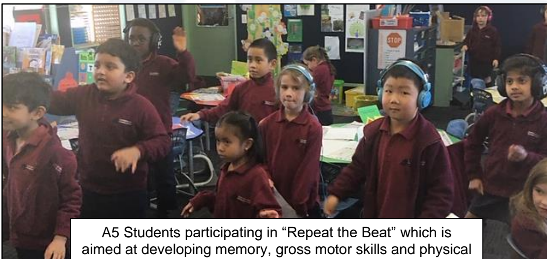
A5 Students participating in "Repeat the Beat" which is aimed at developing memory, gross motor skills and physical movement.