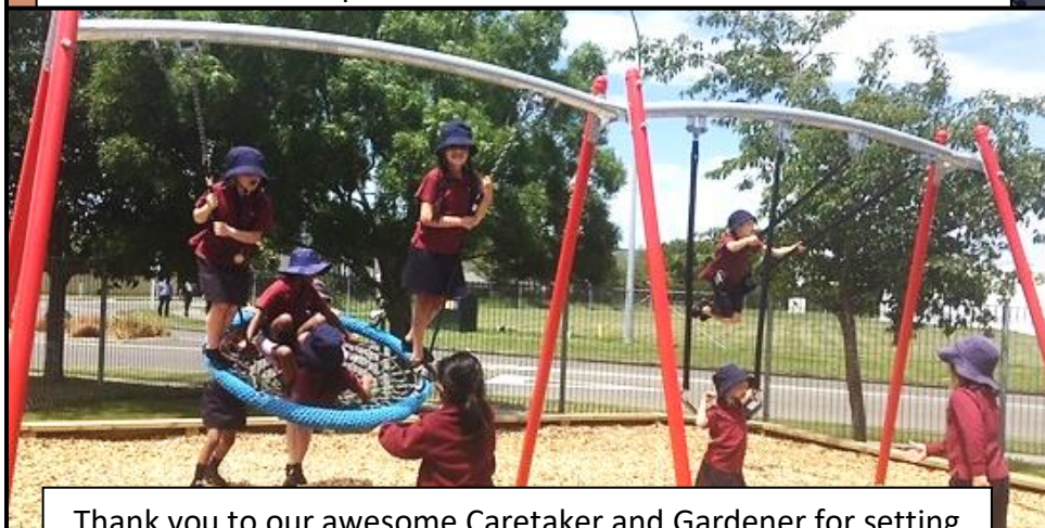
Thank you to our awesome Caretaker and Gardener for setting up our new swing set. It is very popular with our junior students.