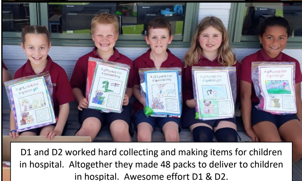
D1 and D2 worked hard collecting and making items for children in hospital. Altogether they made 48 packs to deliver to children in hospital. Awesome effort D1 & D2.