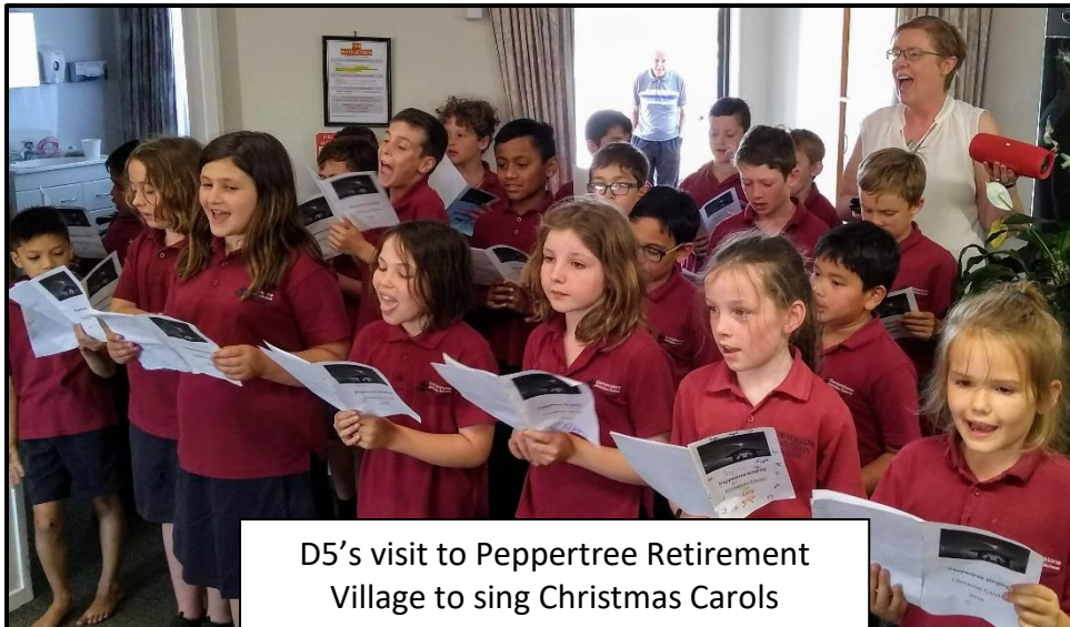
D5's visit to Peppertree Retirement Village to sing Christmas Carols