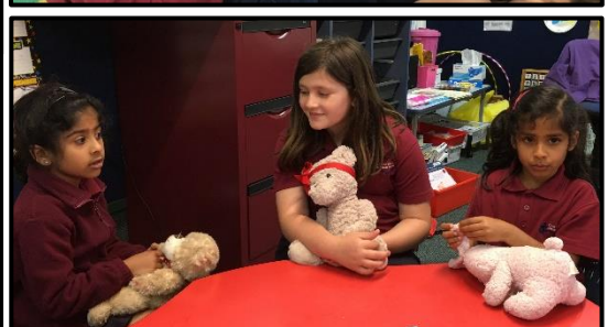
Above: A1, A2 and A2+ had a Teddy Bears Picnic this week with their buddy class as part of their Giving project.

Mission: "To provide, with parents, a balanced Christian education to help children develop to their full potential in God."