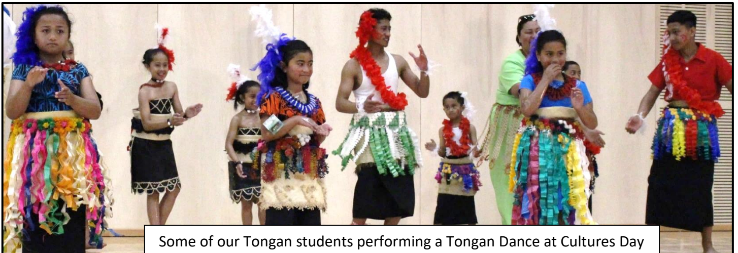
Some of our Tongan students performing a Tongan Dance at Cultures Day

Mission: "To provide, with parents, a balanced Christian education to help children develop to their full potential in God."