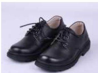
Boys' leather shoes