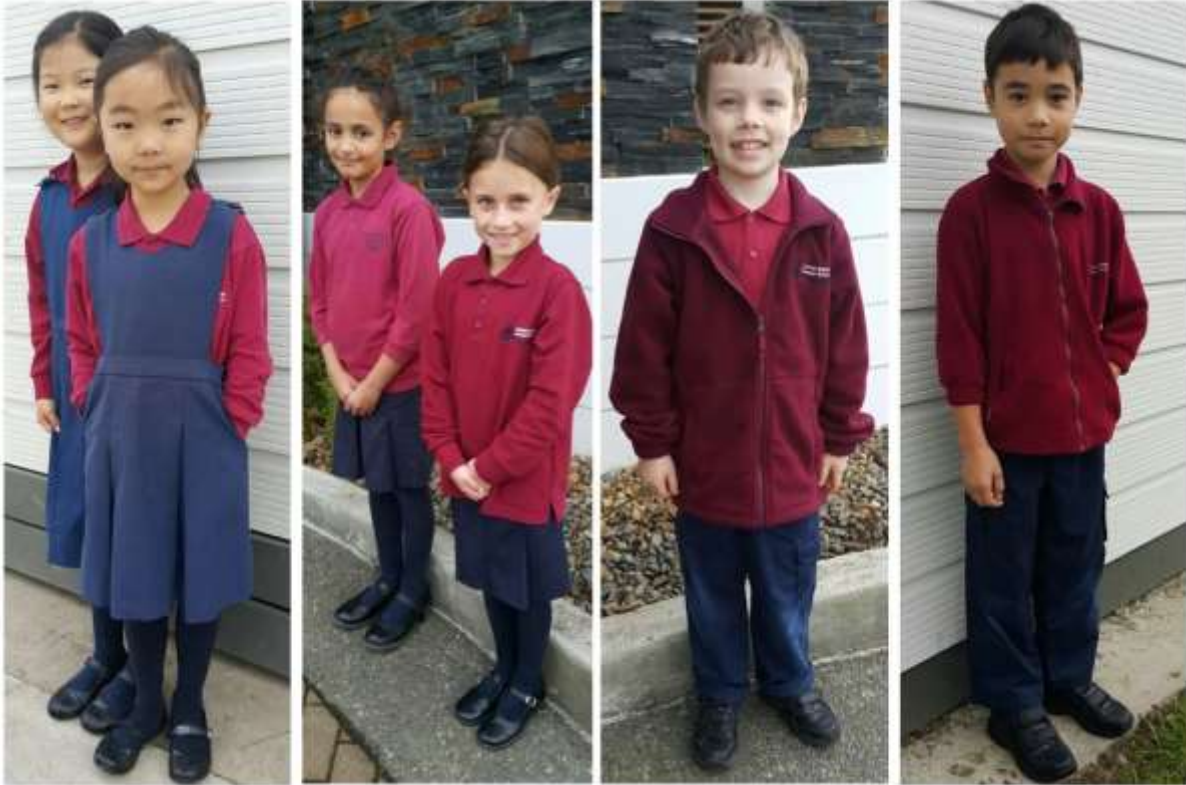
Above: Examples of Year 0-6 uniform