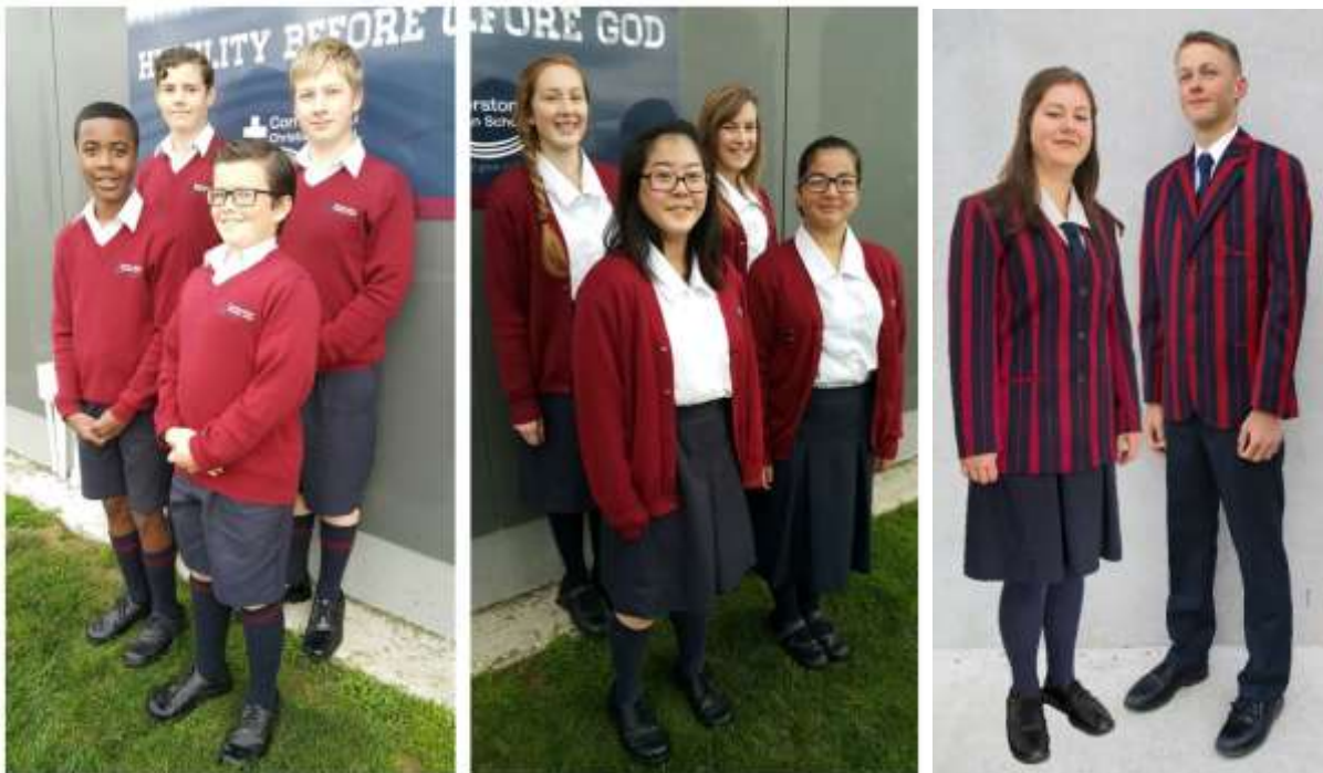
Above left and centre: Examples of Years 7-13 uniform