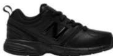
Black leather look sneakers