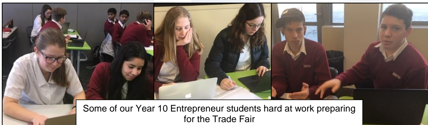
Some of our Year 10 Entrepreneur students hard at work preparing for the Trade Fair

PLACE: Main Netball Court Outside the Staffroom