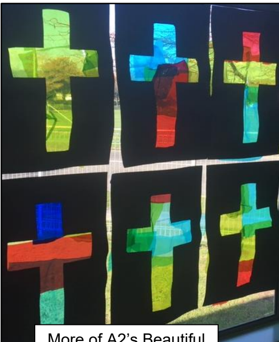
More of A2's Beautiful Artwork!