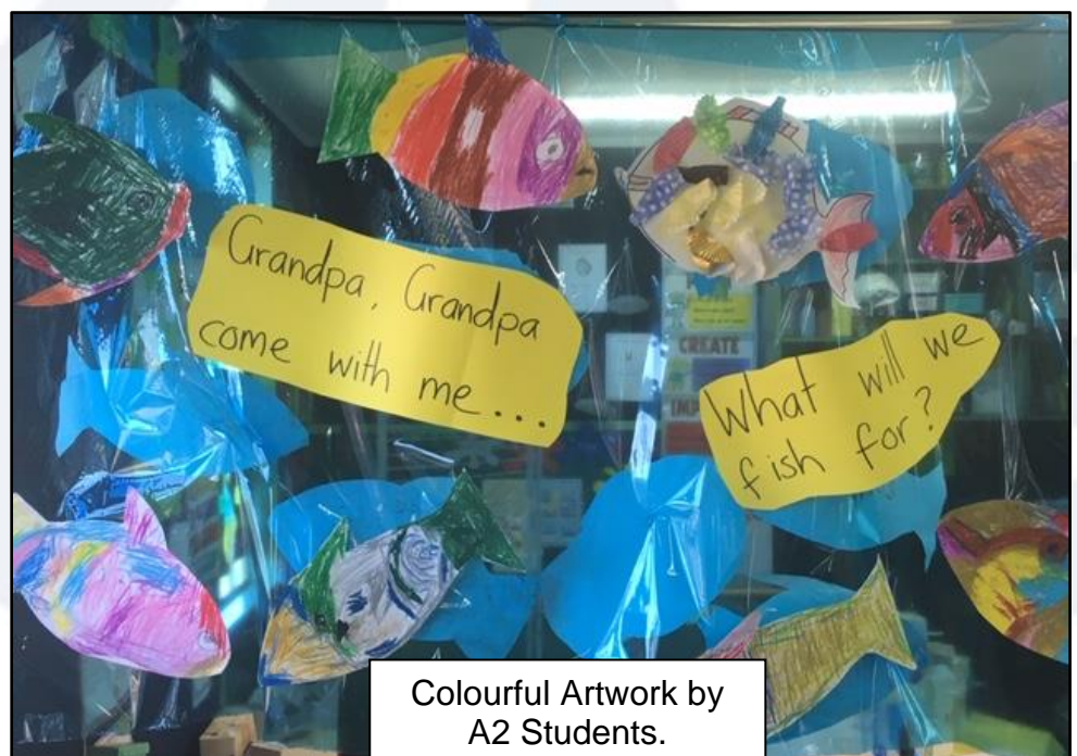
Colourful Artwork by A2 Students.