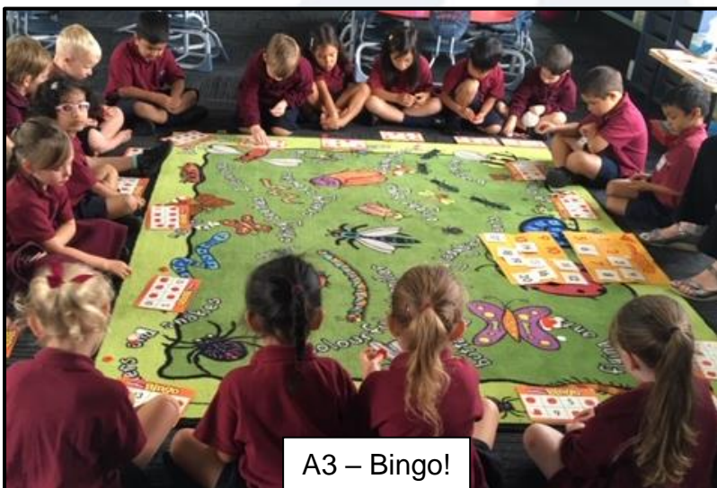
A3 – Bingo!