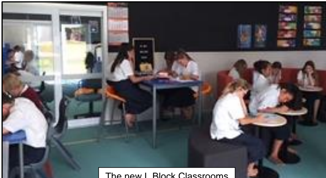
The new L Block Classrooms (Year 7 & 8)