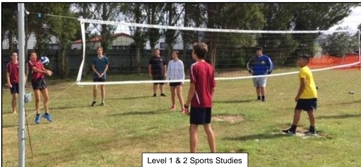
Level 1 & 2 Sports Studies

A new school sports uniform is coming soon. We hope to have these available to purchase from the school uniform shop from Term 2. Watch this space for further information.