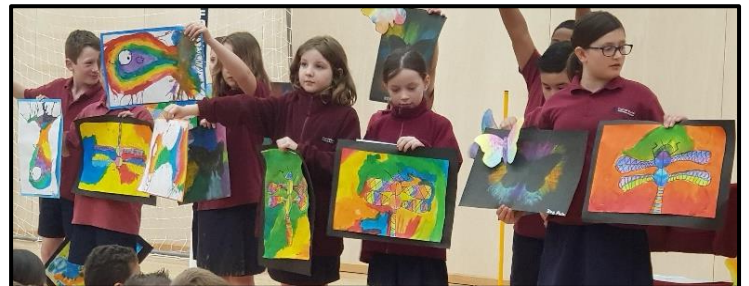
D5 presented their artwork at a recent Manahau Assembly

Order your child's stationery online at myschool.co.nz in December... and you decide when you pay.