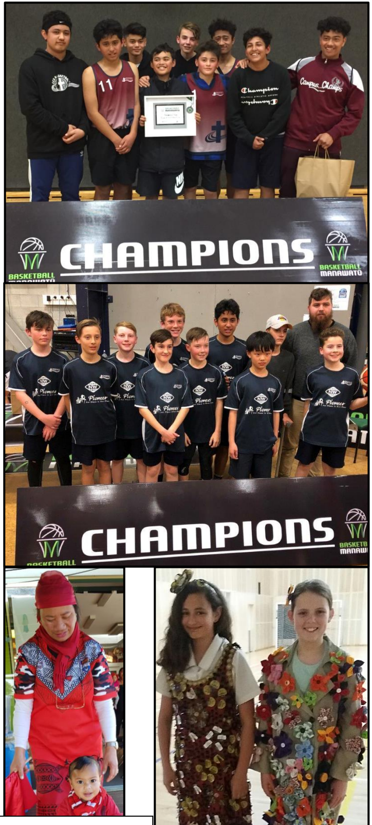
Supporting Tonga in the World Cup at Lalanga Mo'ui.

Please ensure all winter sports uniforms are RETURN TO THE GYM UNIFORM BOX by this Friday (28 th September) including all basketball uniforms. Please ensure they are clean and in a named bag thank you.